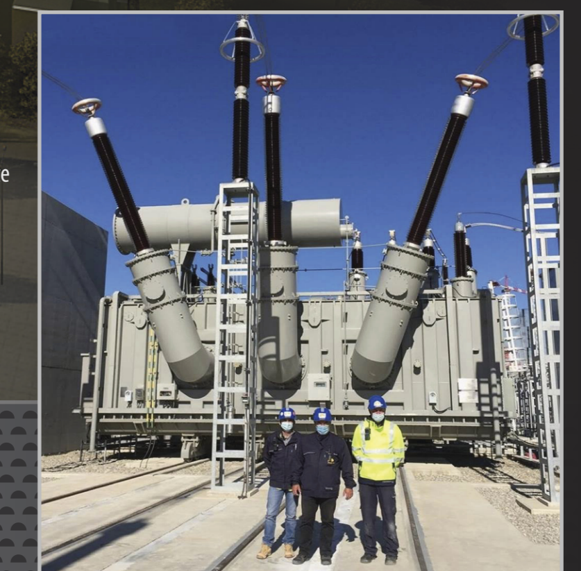
ITER is now fully connected to the French electrical grid, with all seven ITER connections at the 400kV level in operation. (There are three transformers for the pulsed power network and four for the steady state electrical network.)

THE ITER PROJECT IS CURRENTLY UNDER CONSTRUCTION IN SOUTHERN FRANCE, ON A SITE 75 KM NORTH OF MARSEILLE.