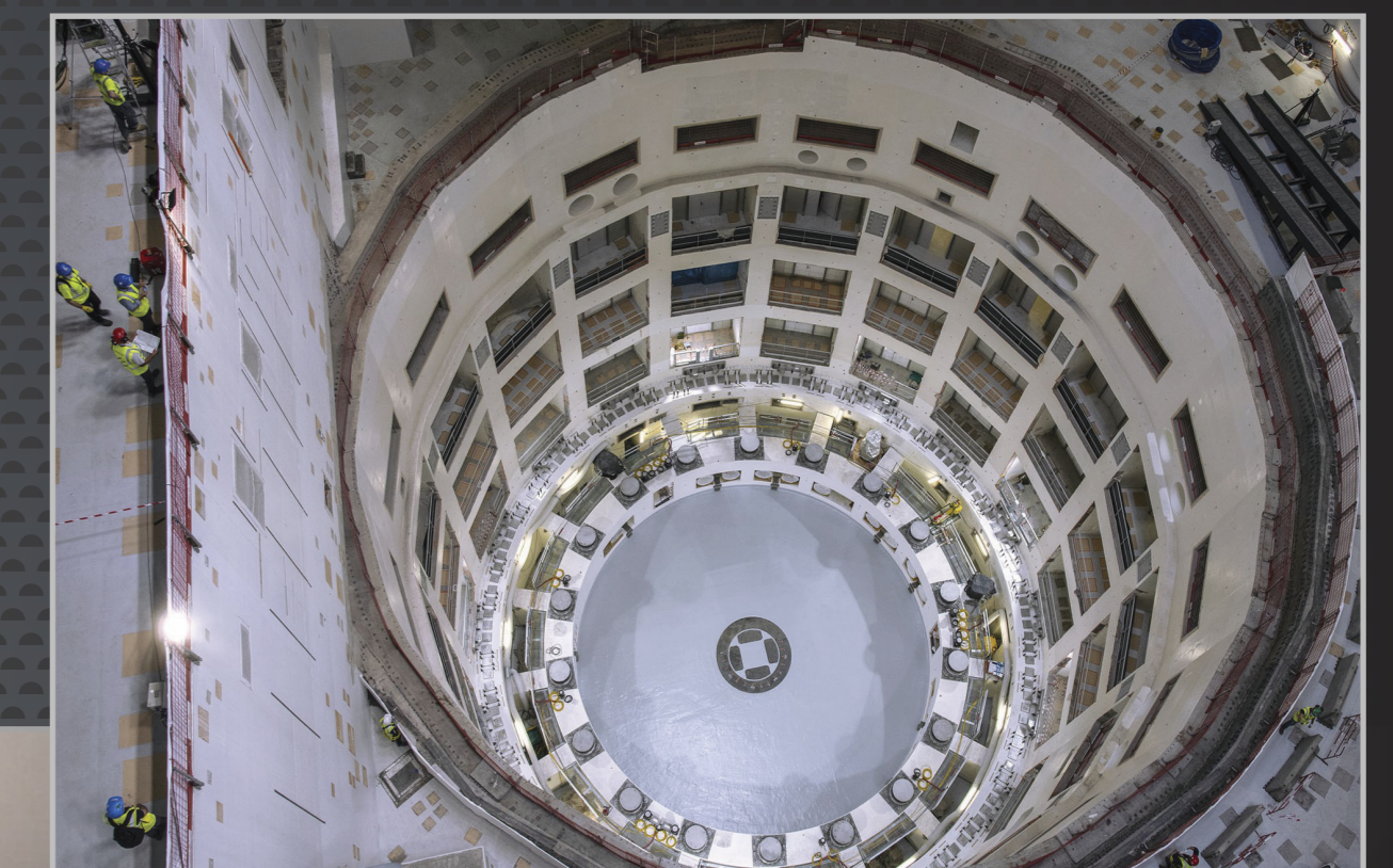
The 30-metre-deep well at the centre of the Tokamak Building (E) is ready in May 2020 for the installation of the first machine components – the cryostat base and lower cylinder. Eighteen ball and socket joints (cryostat bearings) will be the interface between the base of the machine and the support crown in concrete.