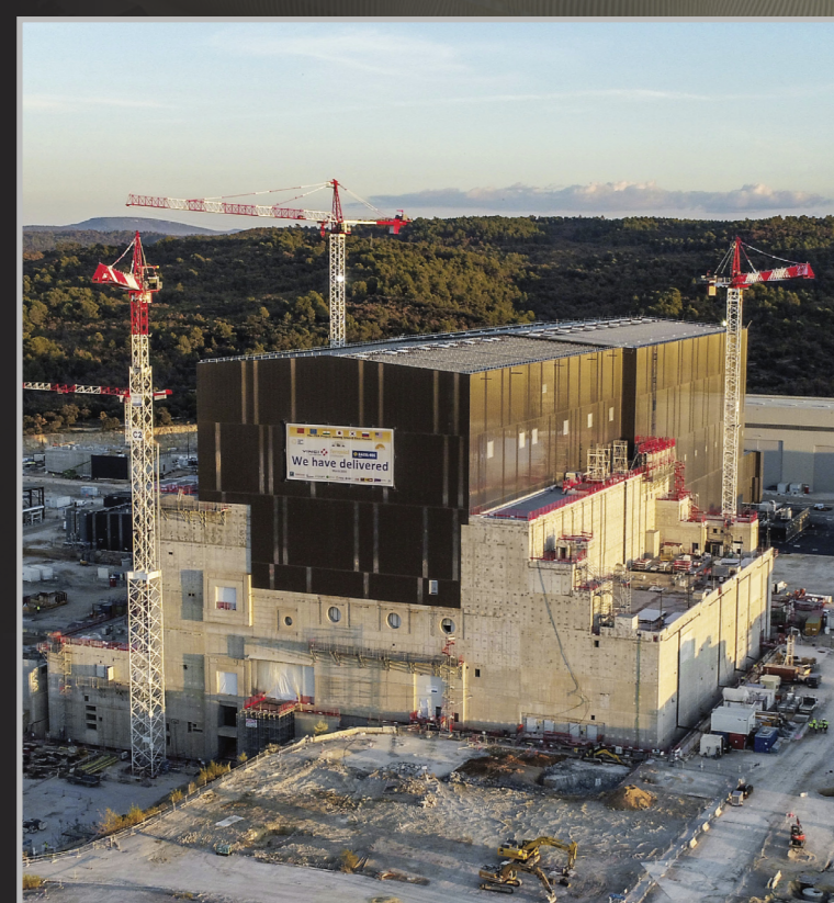
The Tokamak Building (E), at the heart of ITER construction, was completed in 2020 with the finalization of the metal crane hall. This concludes eight years of collaboration by the European Domestic Agency, Fusion for Energy (F4E), and the joint ITER Organization/F4E Buildings Infrastructure and Power Supplies (BIPS) team. An estimated 1,000 men and women took part.