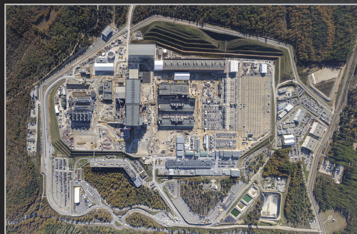
Approximately 75% of the buildings and technical areas needed for First Plasma are in place. Major projects in the next years include the ITER Control Room (B) and the neutral beam power supply infrastructure (F).

The ITER Organization entered an important phase of its history in August 2010, when construction began on the first of 39 buildings and technical areas of the ITER scientific installation. Ten years later, 75% of the infrastructure needed for First Plasma is in place and the European Domestic Agency, responsible for financing and supervising the construction of nearly all buildings as part of its in-kind contribution to the ITER Project, is progressively handing over completed areas to the ITER Organization for installation and assembly of the ITER machine and plant.