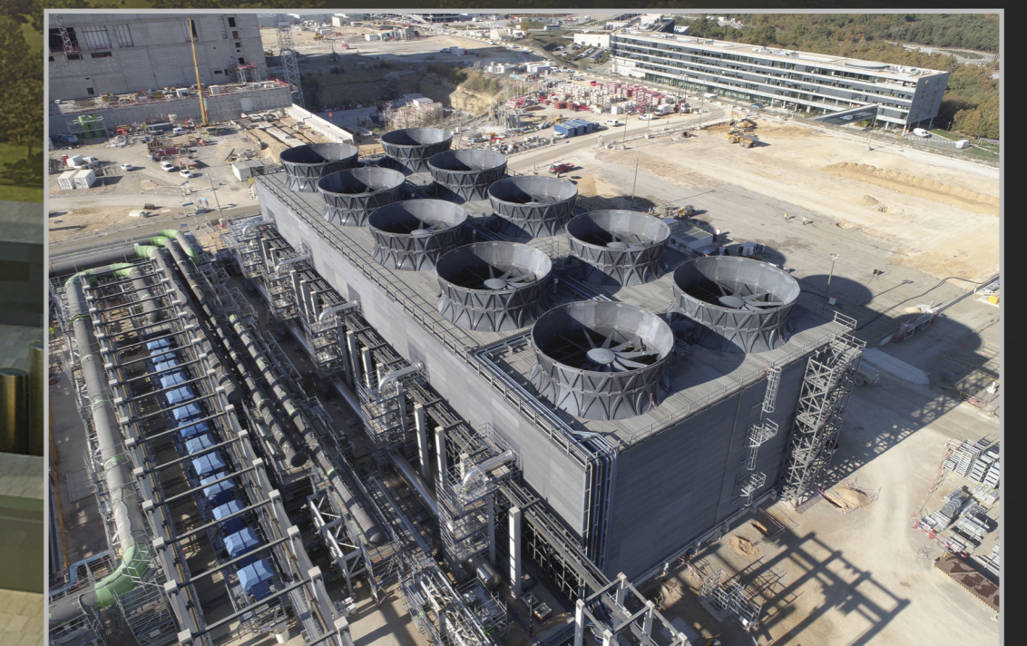
After recuperating the heat of the machine, the water circulating in the installation will be diverted to this zone (C) where it will be cooled using an evaporative process in the ten cooling cells and then reintroduced into the cooling circuits.